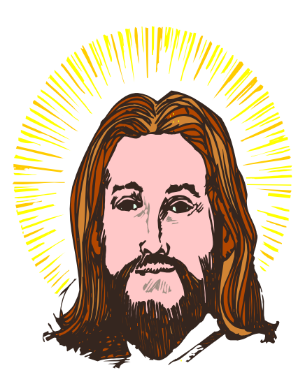
THE SPIRIT HUSBAND

2CO 11:1 Would to God ye could bear with me a little in my folly: and indeed bear with me.