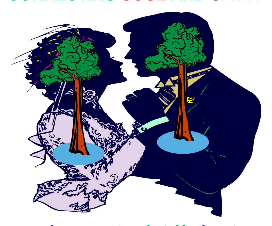
JER 17:8 For he shall be as a tree planted by the waters , and that spreadeth out her roots by the river , and shall not see when heat cometh, but her leaf shall be green; and shall not be careful in the year of drought, neither shall cease from yielding fruit.

In terms of our anatomy, the living water rises to the right side of the cranium and enters the right brain which primarily interprets the matters of the spirit. It is here at the top of the spinal cord where our altar is located. For here, we present our bodies as a living sacrifice that our minds may be transformed. When we subjugate the wants and desires of the body to the flow of the spirit, then we fulfill the prophecy given many years ago by Ezekiel - the flow of the spirit waters the garden of our soul.